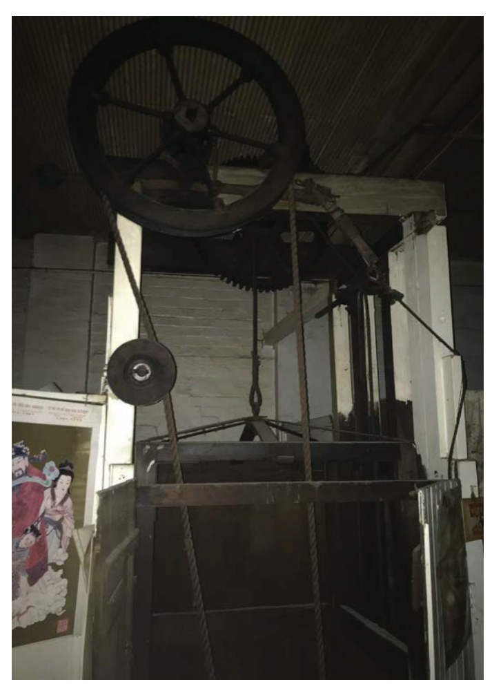
Figure 4: Goods lift mechanism.