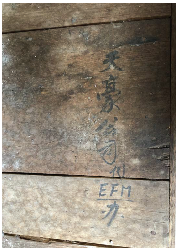
Figure 12: Close-up of packing-crate furniture.