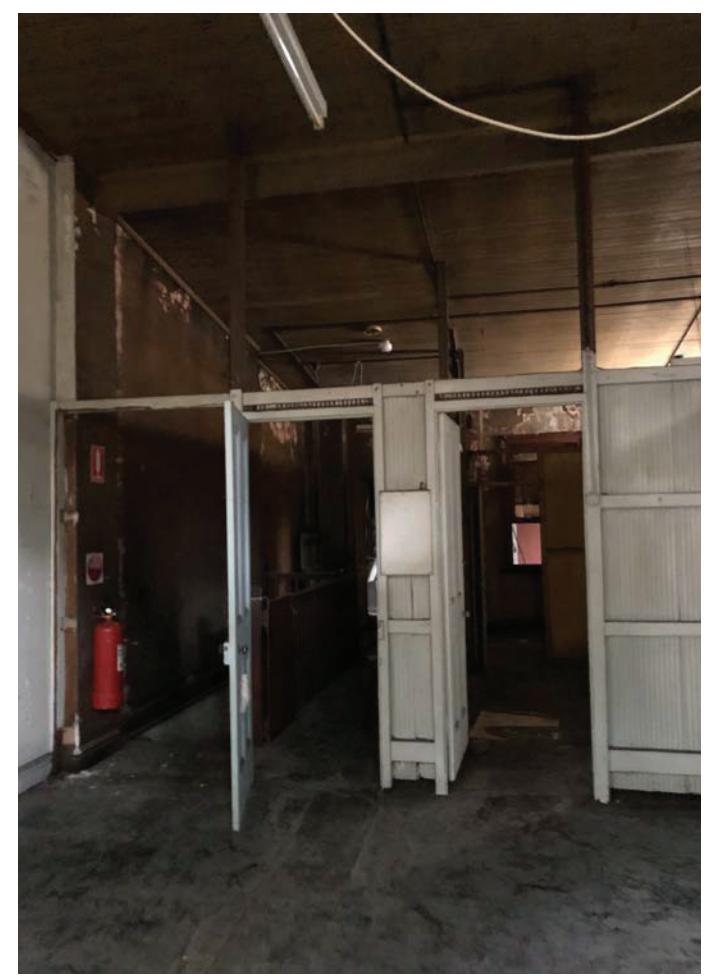
Figure 9: Second floor partitions, 84 Dixon Street.