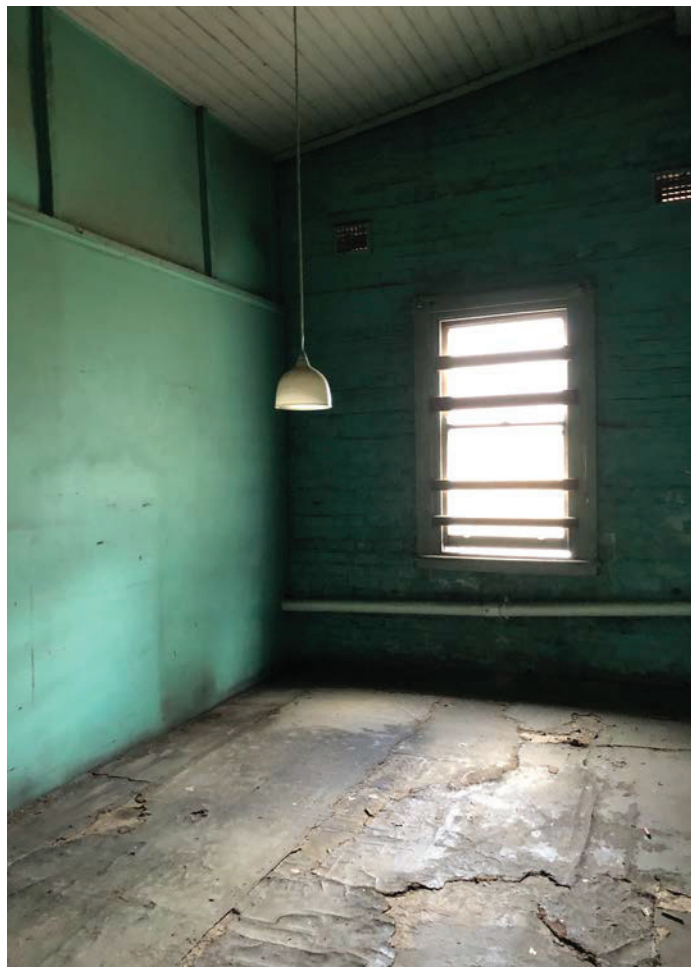
Figure 10: Second floor bedroom, 84 Dixon Street.