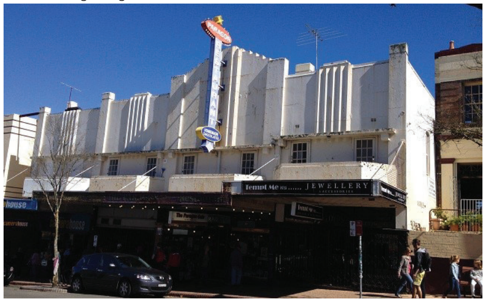
Figure 2: Paragon Café, Katoomba.

Constructed in 1909, two shops were leased in 1923 and combined to create the present-day Paragon Café, completed by 1936. The café is a rare example of an inter-war refreshment room with surviving interiors and shopfronts. It is also of significance as a tourist destination and as a food business established in the early twentieth century by Greek migrants. It is listed on the State Heritage Register.<sup>22</sup>