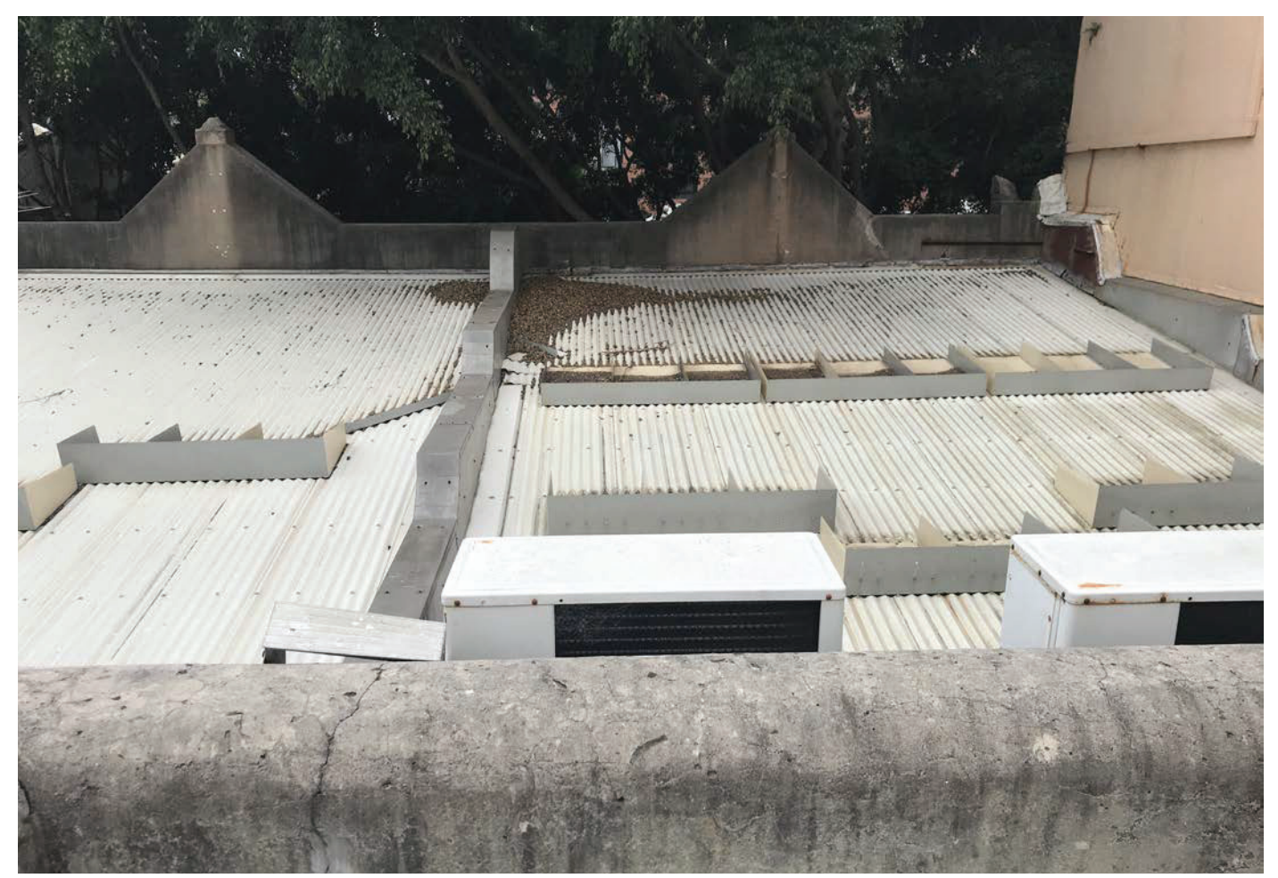
Figure 15: Roof.