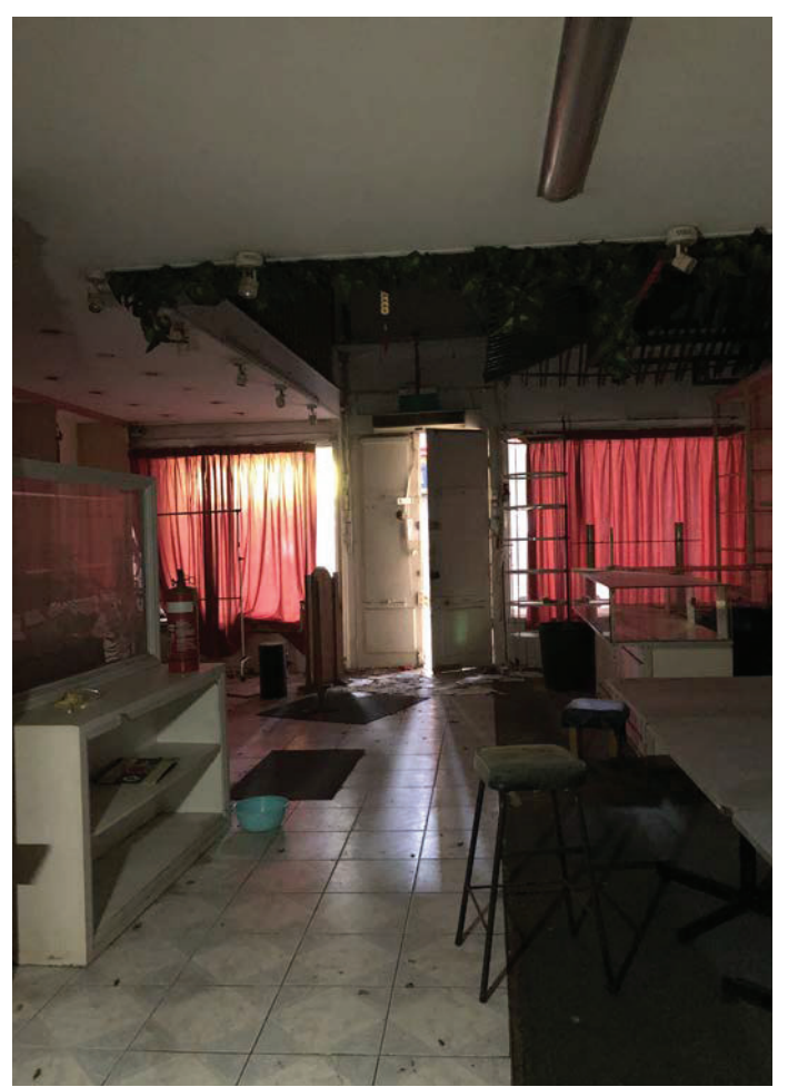
Figure 2: 84 Dixon Street ground floor.