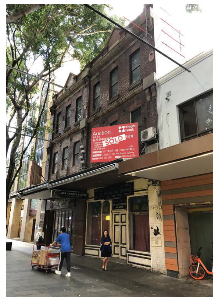
Figure 1: Exterior from Dixon Street.