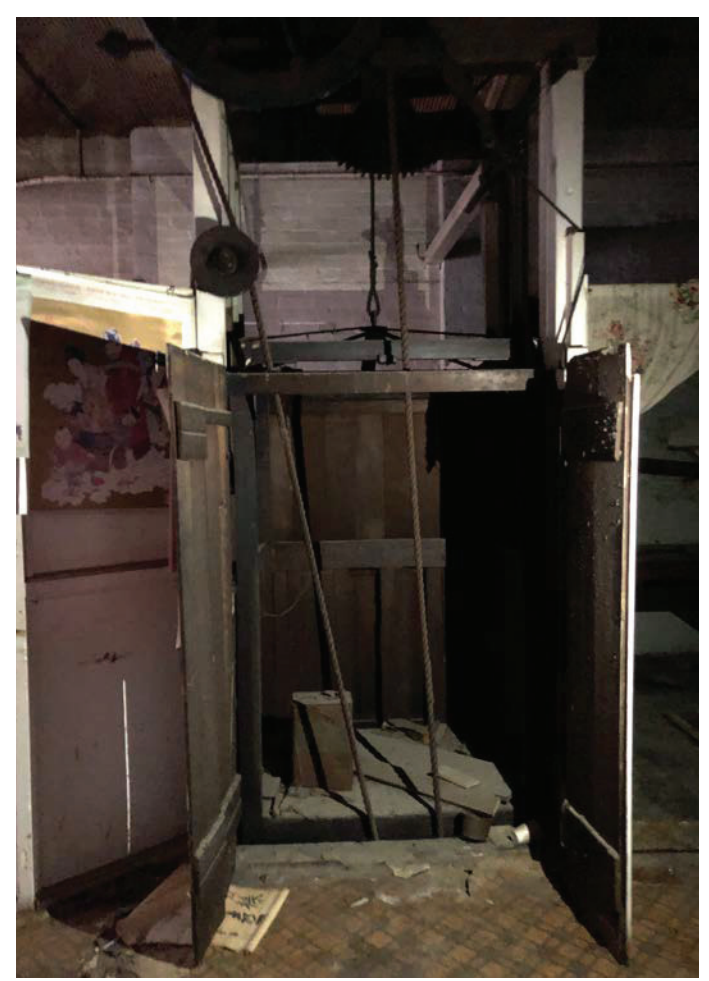
Figure 3: Hand-operated goods lift and assorted ephemera, first floor, 84 Dixon Street.