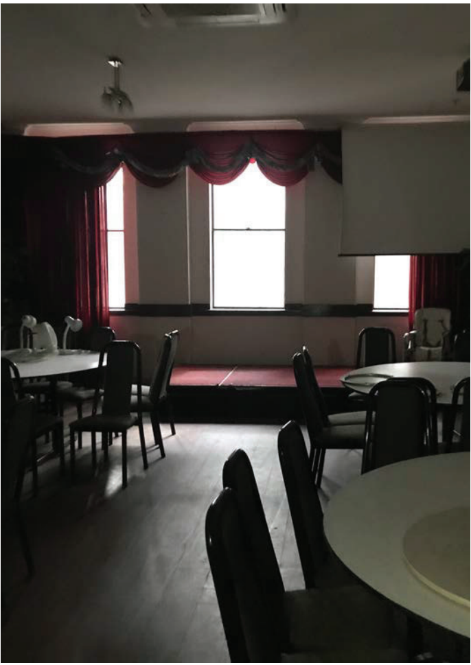
Figure 14: First floor, 82 Dixon Street.