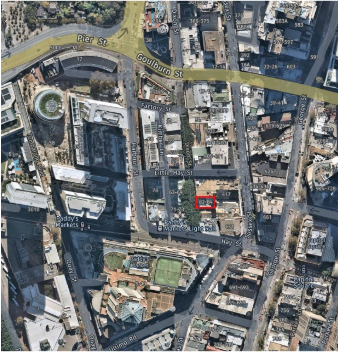
Figure 1: 82-84 Dixon Street, Haymarket is shown by a red rectangle.

The boundary of the site is the boundary of land title Lot 1, DP 66034.