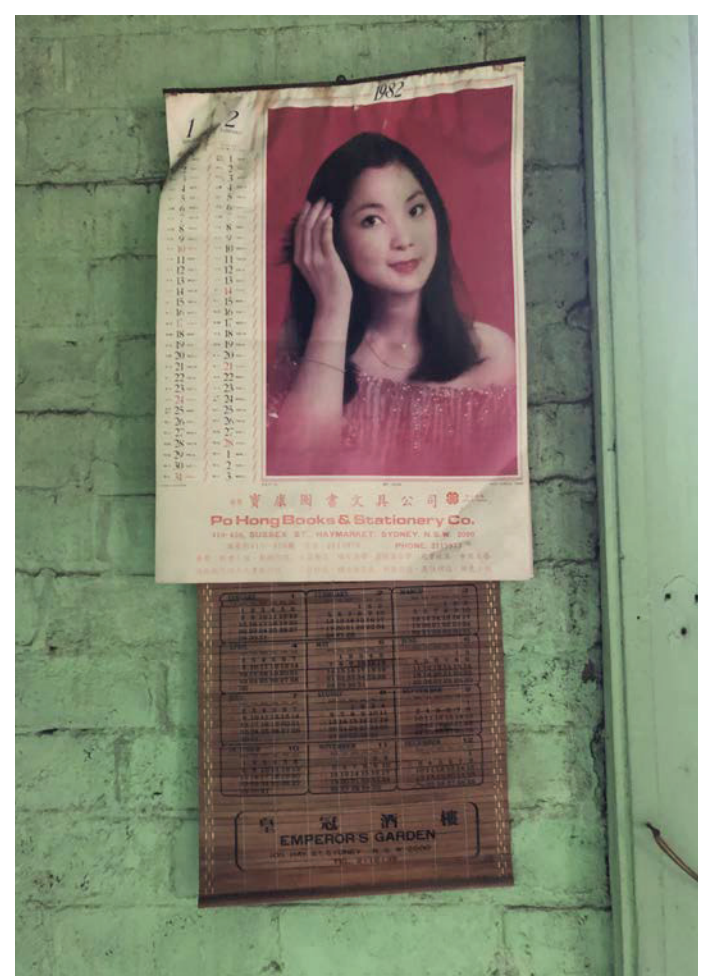
Figure 13: Calendar dating from 1982, 84 Dixon Street.