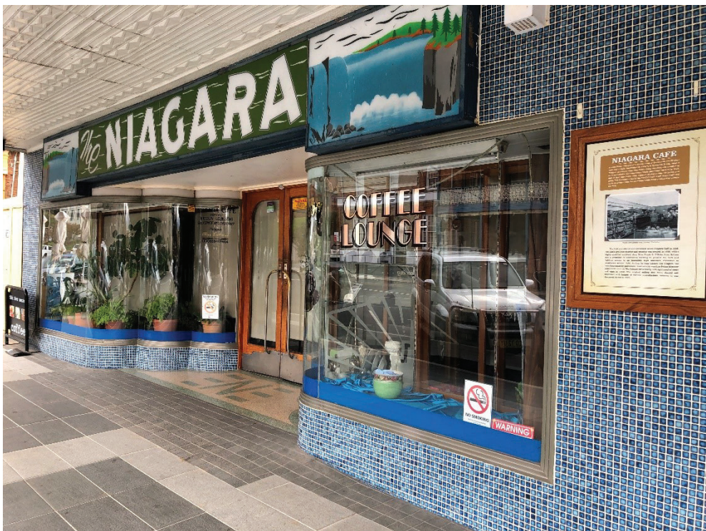
Figure 3: Niagara Café, Gundagai, NSW.

This café was opened in Gundagai by immigrants from Greece in 1902.<sup>23</sup> It still contains much of its original furniture and fittings, including booths, mirrors, and a vintage neon sign.<sup>24</sup>