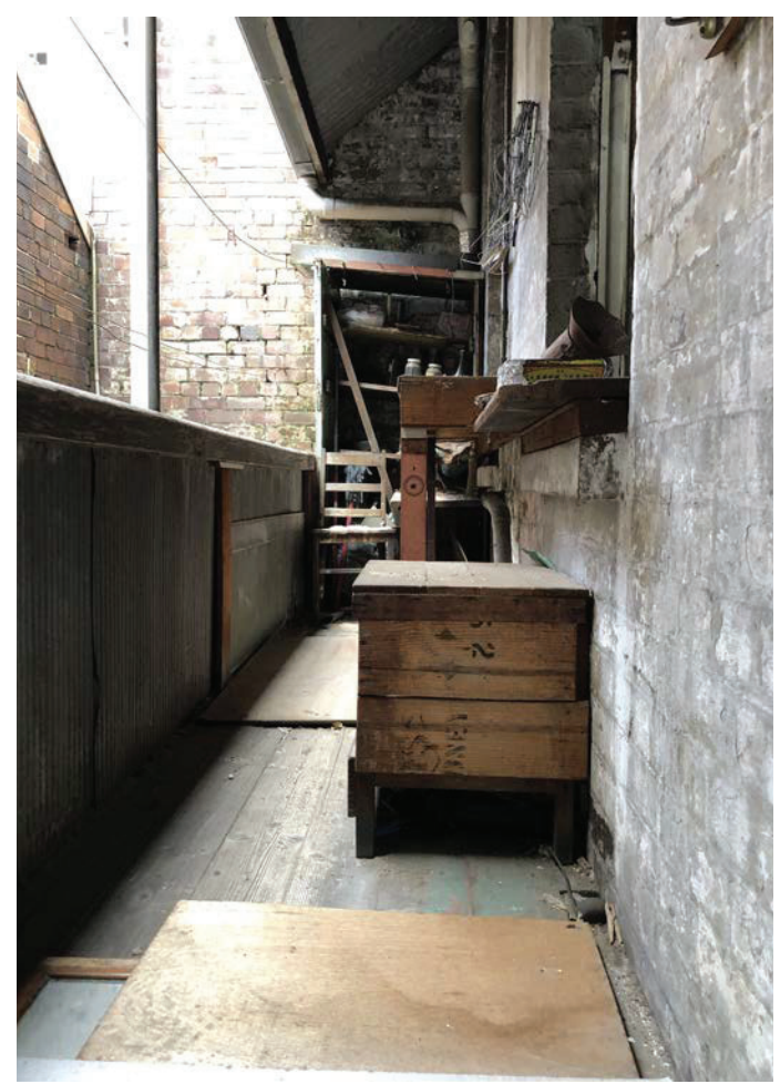
Figure 5: Rear balcony, 84 Dixon Street, showing packing crate furniture.