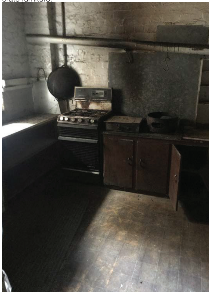
Figure 7: First floor kitchen, 84 Dixon Street.