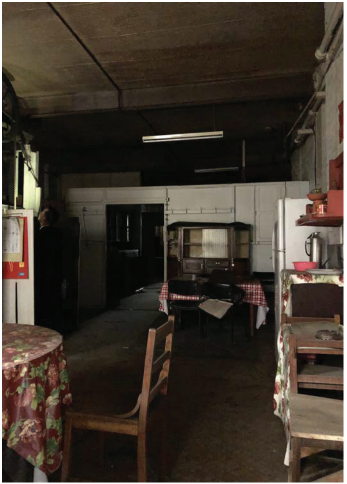
Figure 6: First floor, 84 Dixon Street, including assorted ephemera.