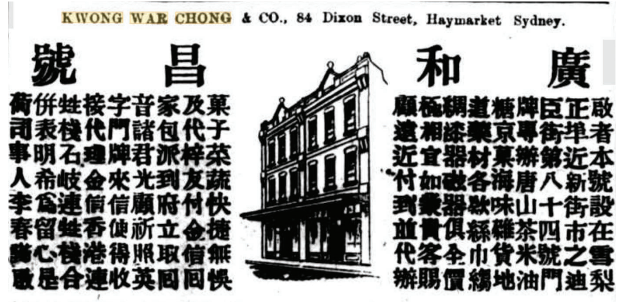
Figure 2: A 1910 advertisement for the newly opened Dixon Street premises of Kwong War Chong & Co. (Source: 1910 'Advertising' Guang yi hua bao [ Chinese Australian Herald ] 12 Nov 1910 p. 5)

of Council discussions with a Dixon Street Chinese Committee on the identity of a larger Chinatown district extending beyond Dixon Street into the area of the soon-to-be-vacated Sydney market houses. By the mid-1970s some Chinese-style street lighting was installed in Dixon Street, and in 1979 the street was pedestrianised. The Lord Mayor officially opened the new Chinatown, complete with damen arches, in 1980.<sup>19</sup>