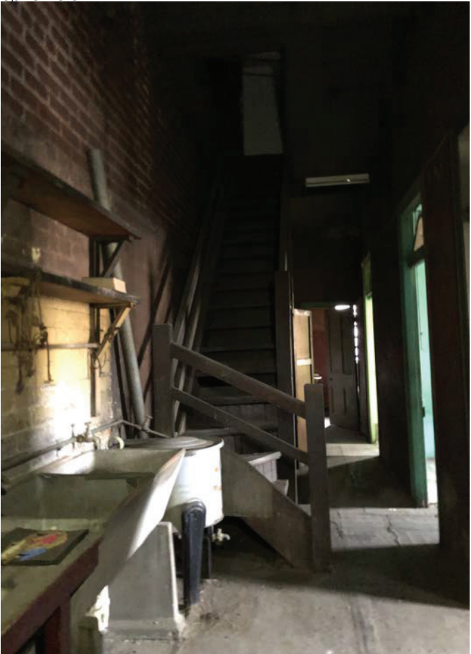
Figure 8: Historic staircase, fixtures and washing machine, 84 Dixon Street. 61