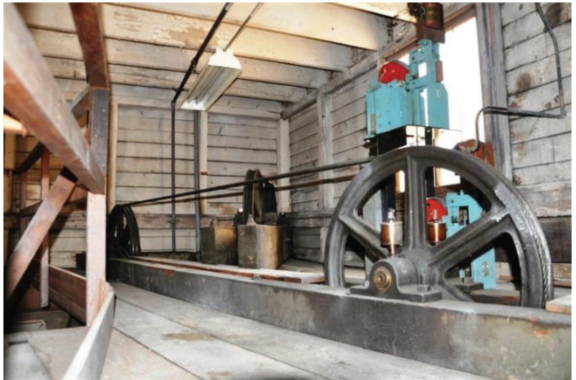
Figure 5: Hydraulic lift cable room