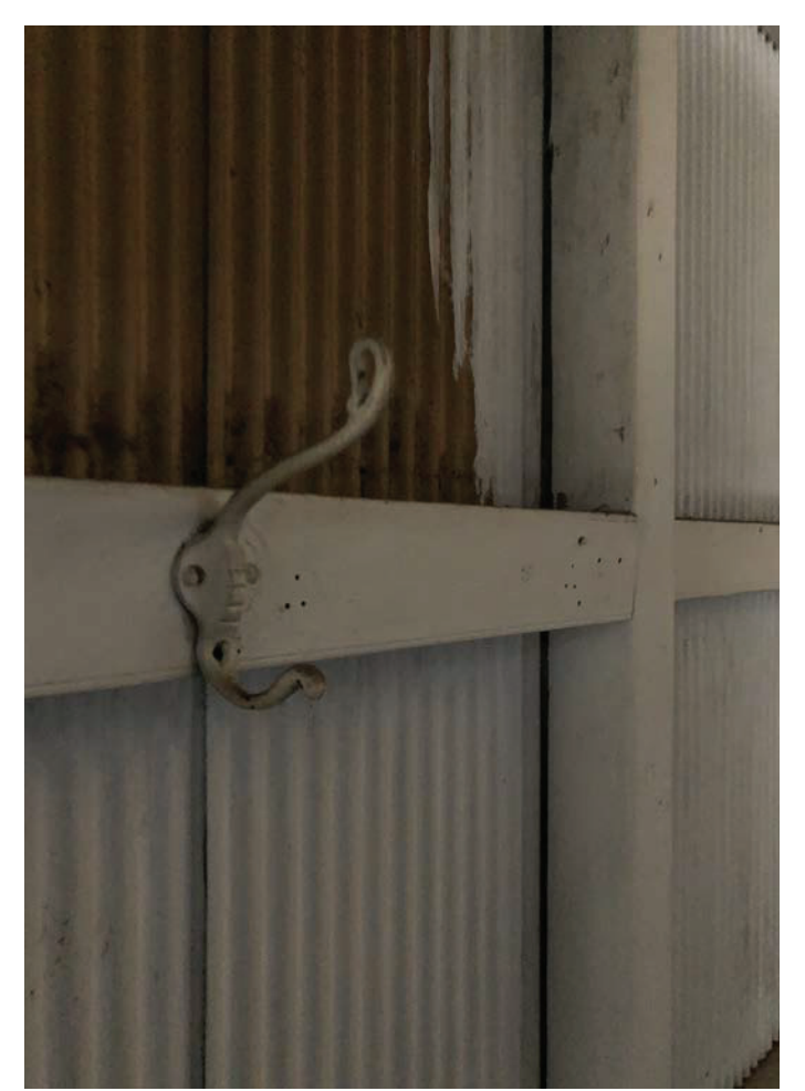
Figure 11: Coat hook with sculpted detail.