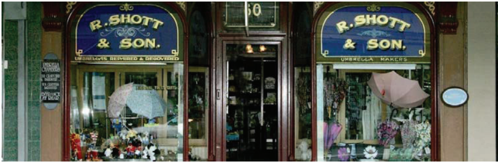
Figure 4: Paragon Café, Katoomba.

Built in 1860 and formerly used as a grocery store, the Shott family moved their umbrella business to its current premises in 1920, vacating the neighbouring shop they had established in 1907. Still run as a shop by the National Trust, it contains original fittings and a collection of ephemera.<sup>25</sup>